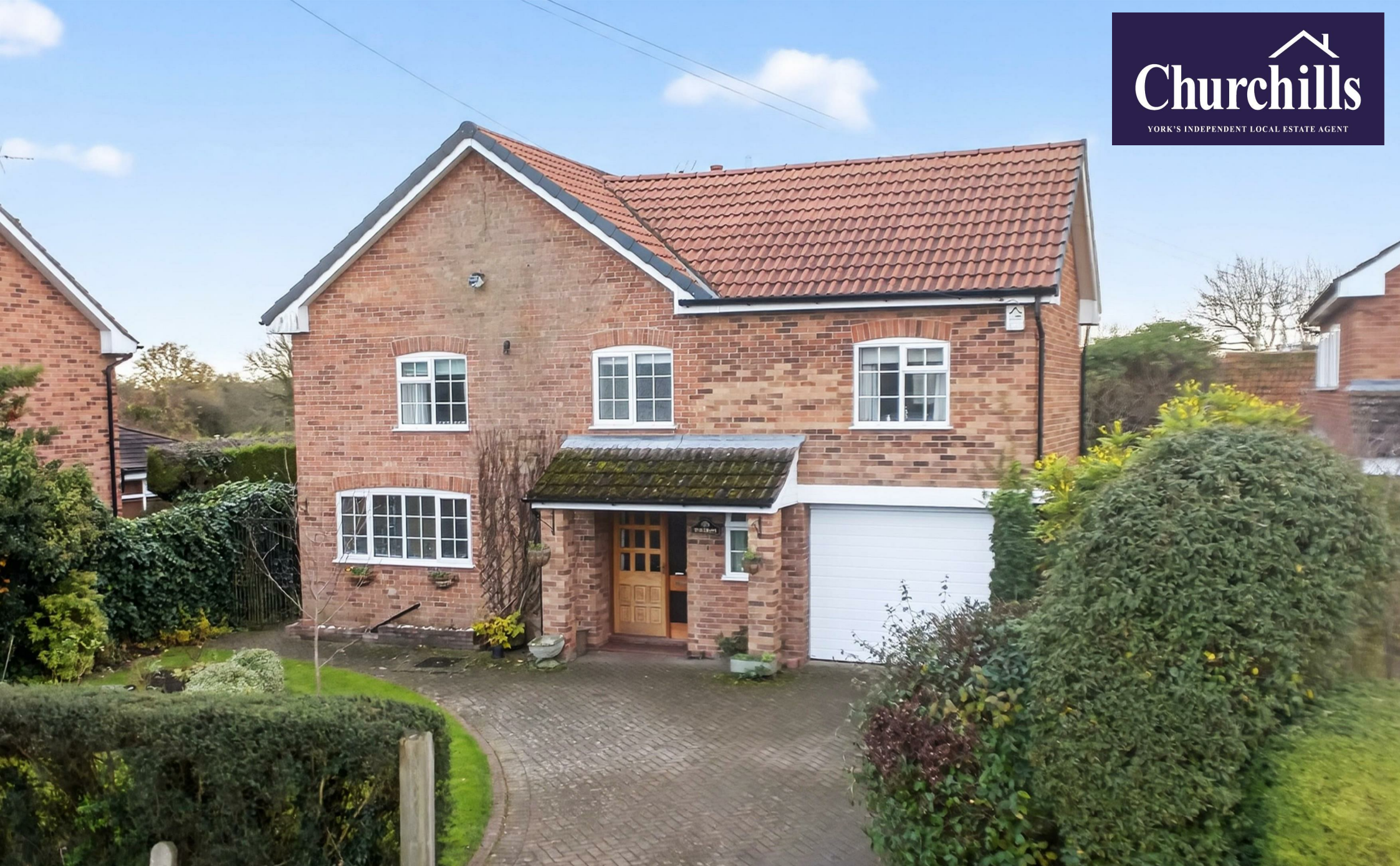
Waverley Gracious Street Hubby Easingwold, YO61 1HR £500,000